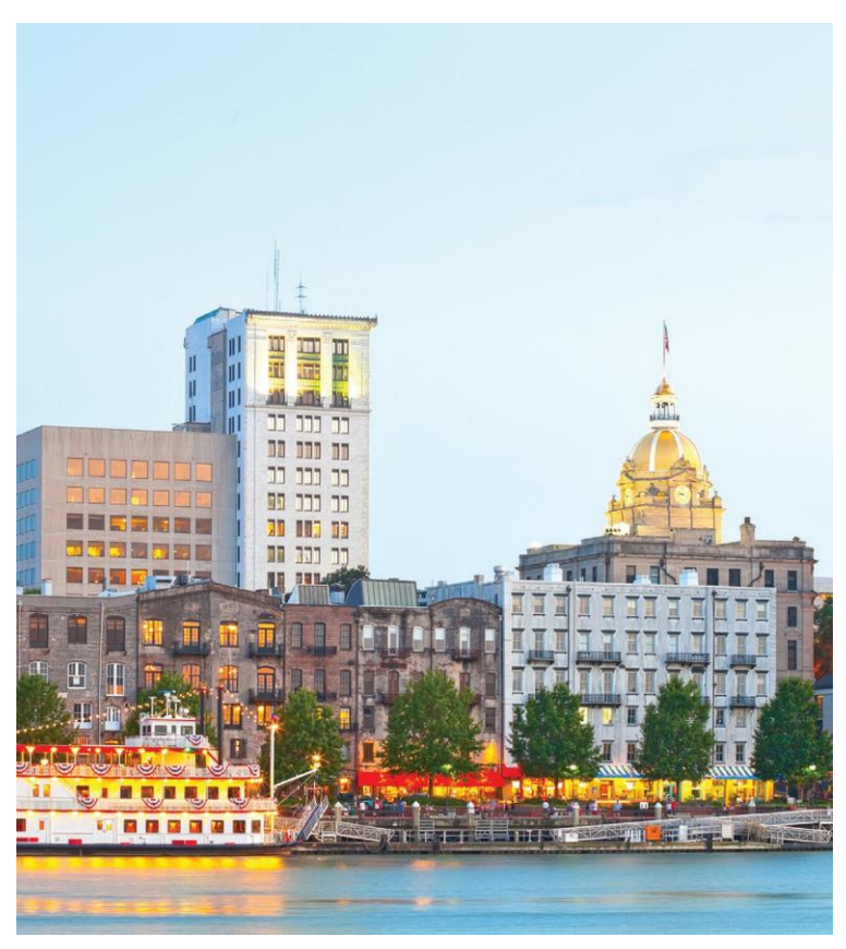
5 Days ● 6 Meals : 4 Breakfasts, 2 Dinners

HIGHLIGHTS... Historic District Trolley Tour, City Market, Dessert Tour, Choice on Tour: First African Baptist Church or Ships of the Sea Maritime Museum, Pin Point, Tybee Island, Dolphin Cruise